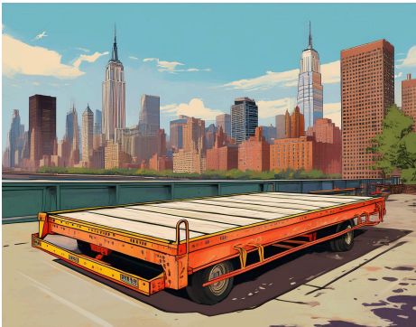
Flatbed (wooden platform)