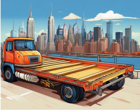
Drop Frame Flatbed (wooden platform)